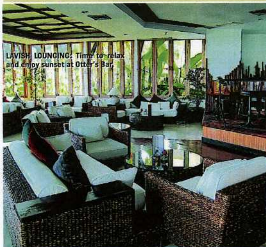
LAVISH LOUNGING: Time to relax and enjoy sunset at Otter's Bar.

The hotel shuttle bus makes regular trips to Panwa Bay Village (0.5km, every 10 minutes, free), Phuket Town (12km, twice daily, small fee), and Patong (32km, once per night, small fee) and Central Department Store (twice daily, small fee). Visit www.capepanwa.com or www.capecollection.com .