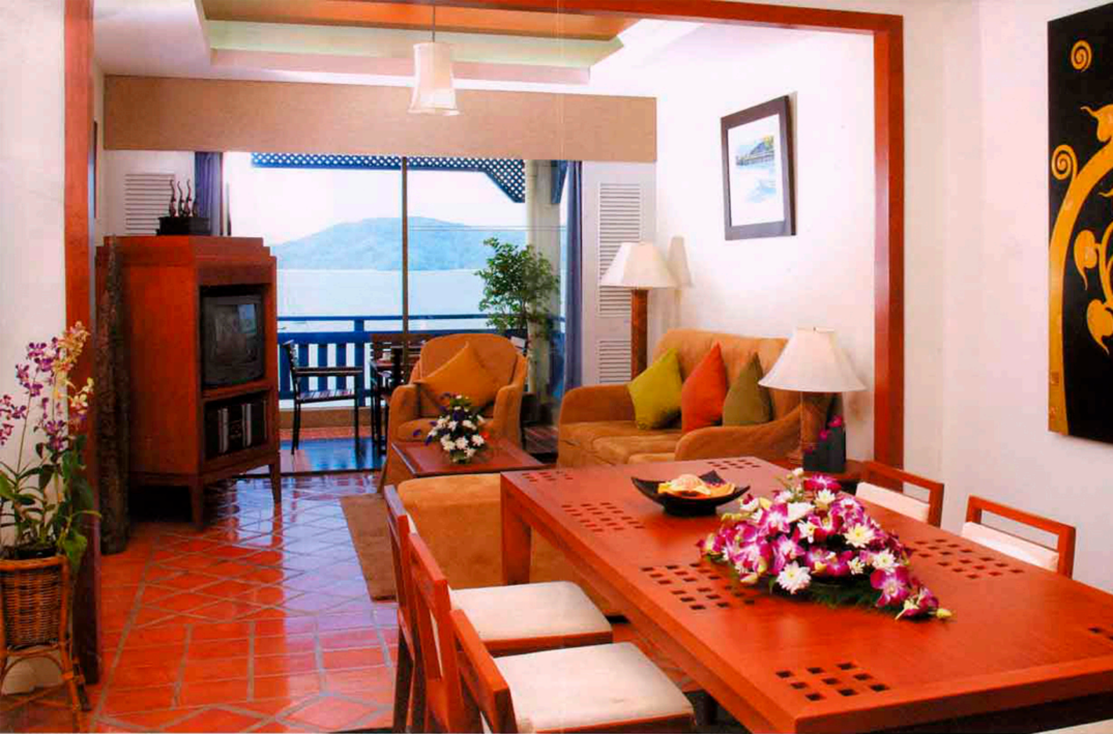
Two Bedroom Suite Living Area