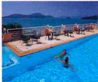
Roof Top Swimming Pool