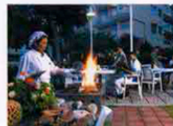
Leam Panwa Restaurant