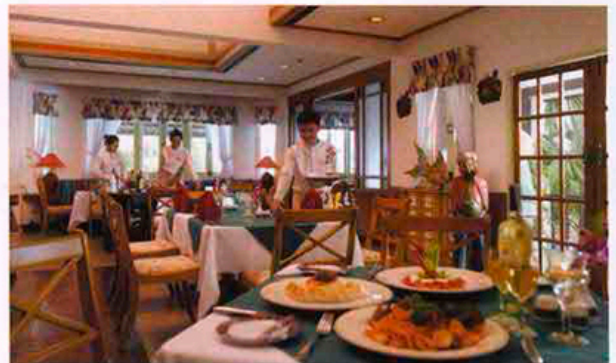
Uncle Nan's Italian Restaurant