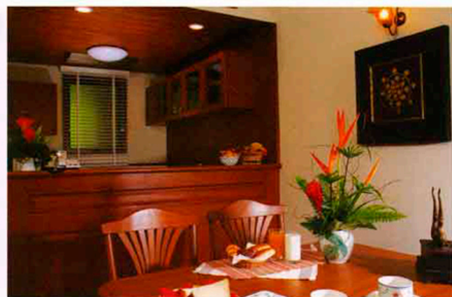
Kitchenette & Dining Area One Bedroom