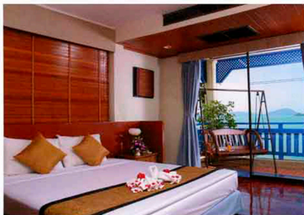
Two Bedroom Suite