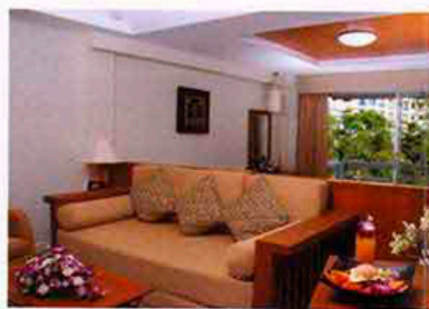
Studio Living Room