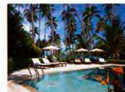
Panwa Lodge Pool

Only a few minutes over the headland from the Kantary Bay Hotel lies the Cape Panwa Hotel and Spa. Both hotels are serviced by a shuttle bus and guests staying at the